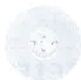
DOT CS LED