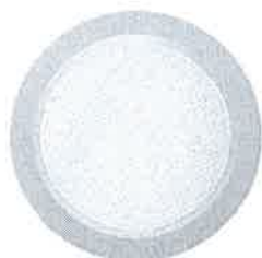
DLN 220 LED IP65