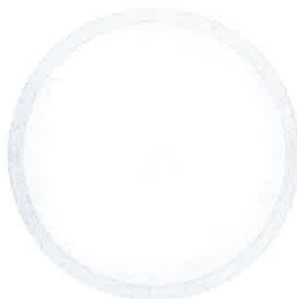
PROXIMA LED IP65