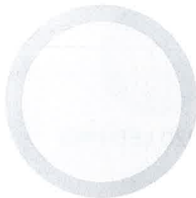
CORIA EDGE LED